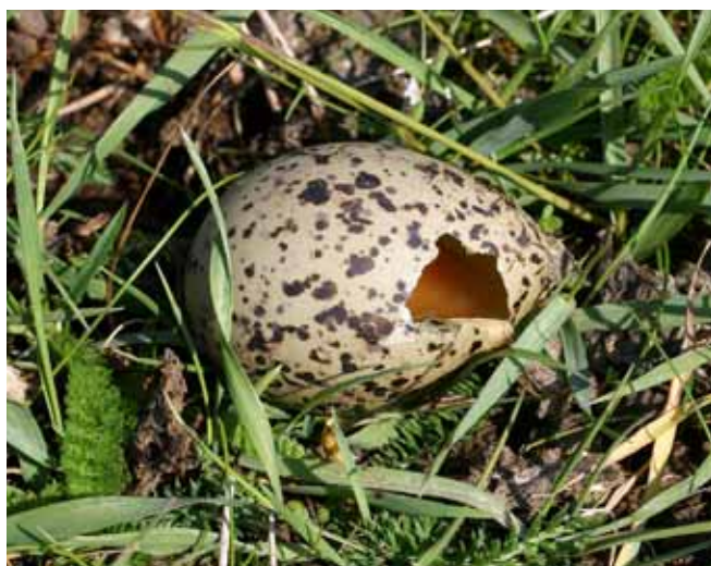
Avocet egg predated by a Corvid.

Because of the extensive breeding failure on Landgrens holme during the last five years, mainly due to floods and predation, some measures have been taken. A provisional dam has been constructed in order to get a stable water level around the breeding islet and