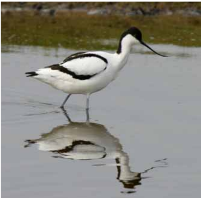
The adult Avocet.

The Avocet returns from its wintering areas in southwestern Europe and northern Africa in late March and early April. It breeds in colonies with up to hundreds of pairs on grazed coastal meadows and sandy reefs. Mating starts immediately after arrival and the first eggs are laid at the end of April. The clutch usually consists of 3 to 4 eggs in a depression in the grass or sand. Both sexes incubate for 23-27 days.