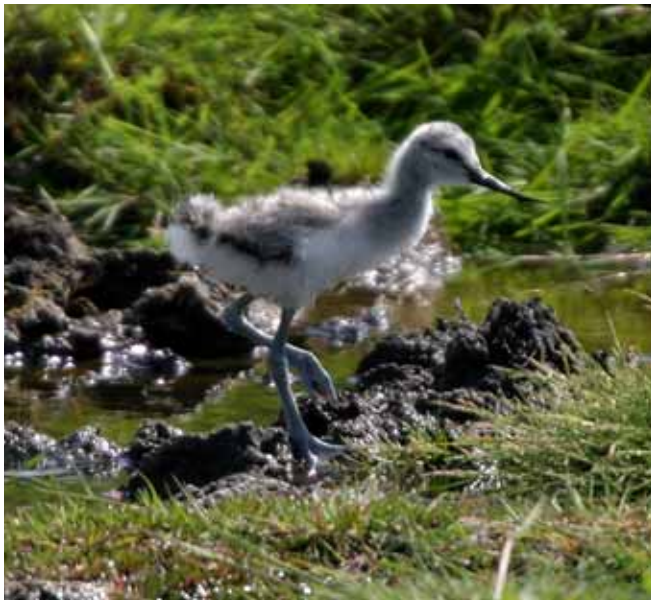
The Avocet chick.

The chicks hatch in late May and a hectic period follows in the Avocet colony. The chicks immediately find their own food in shallow water, guided by their parents. When foraging