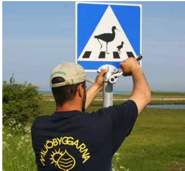
The road sign "Avocet crossing" helping chicks to disperse safely after hatching.

After 35-43 days, depending on food resources, the chicks are fledged. They look very much like the adult birds, but the black parts of the plumage tend to be brownish-black. By now the chicks are independent and the adult birds gather in big flocks before taking off for the moulting areas in Vadehavet along the western coast of Jutland. After finishing the moult the birds continue to their wintering areas. The