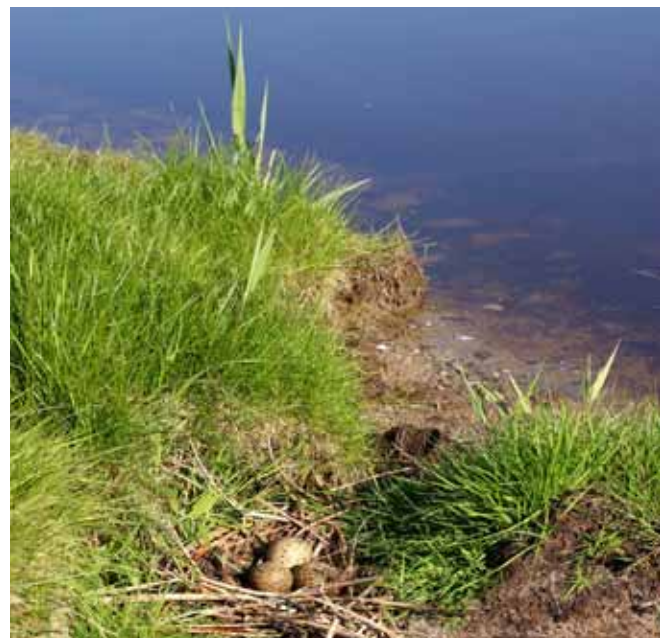
The Avocet's nest.

The first part of the species' scientific name originates from the Latin word recurvirostra (upcurved) and avosetta could be derived from the diminutive form of an old Italian word for a 'small bird'.