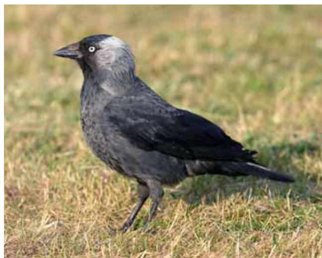
The Jackdaw - a new predator.