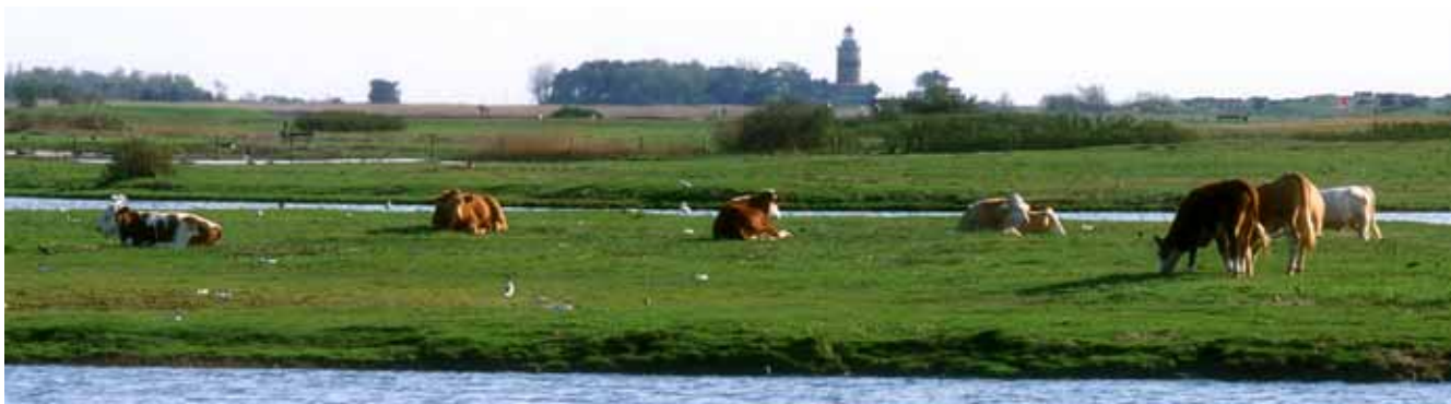
Cattle on Landgrens holme and the Falsterbo Lighthouse.

According to estimates one third of the Swedish population of Avocets breed in Vellinge. The County Administrative Board has given Falsterbo Bird Observatory the task of censusing the breeding population on the Falsterbo peninsula since 1988. The population has varied from some ten to 200 pairs. The diagram (Figure 1) shows the number of pairs starting to breed in the nature reserve of Northern Flommen, a wetland area which includes the main breeding site Landgrens holme.