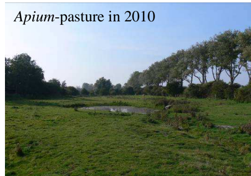
Apium -pasture in 2010

The town administration promised to purchase sites and implement conservation measures within the compensation projects. But up to now they have not started this activity.